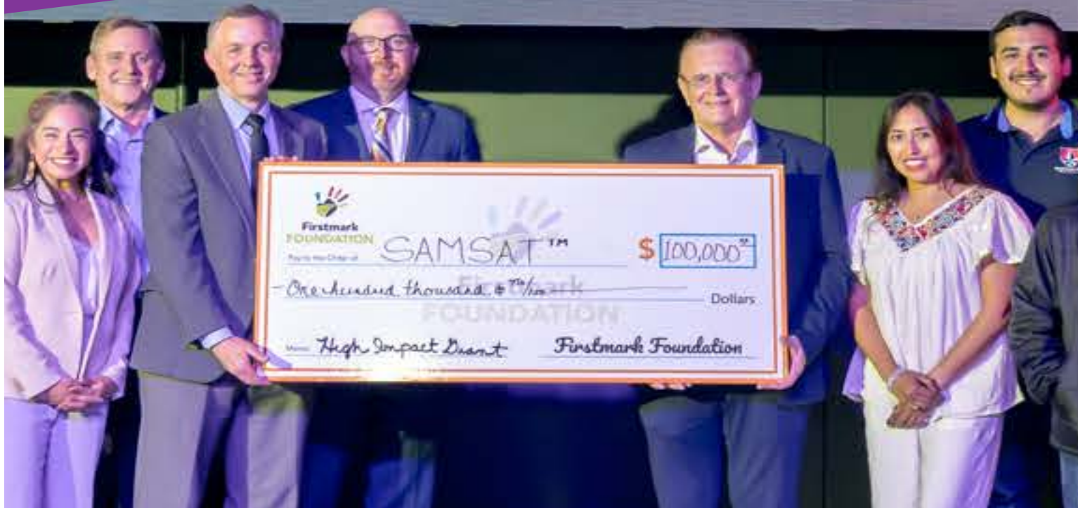
The Firstmark Foundation awarded $100,000 to SAMSAT's Educator Fellows Program, helping teachers who serve in underserved communities.